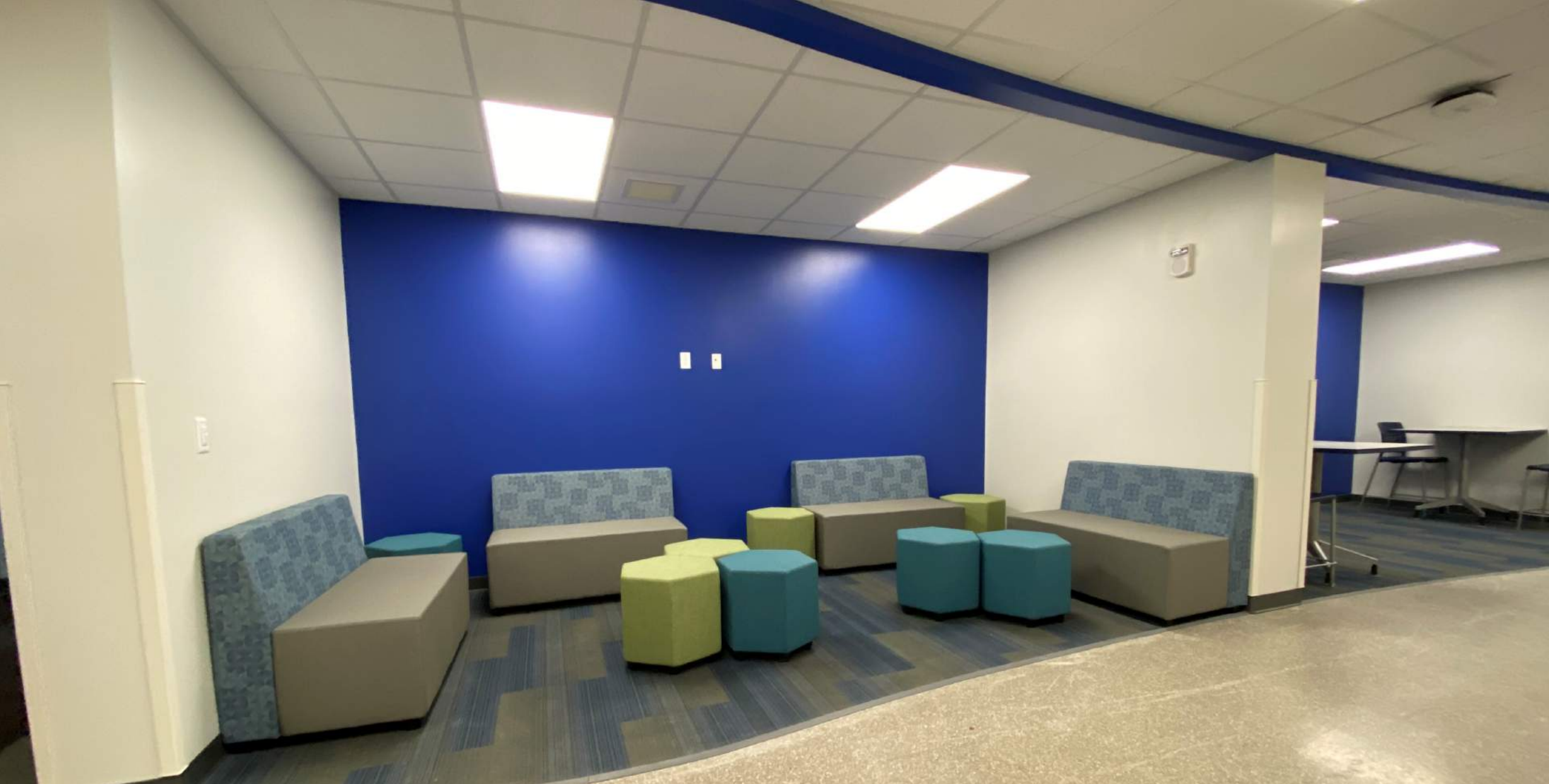
VARIETY OF FURNITURE