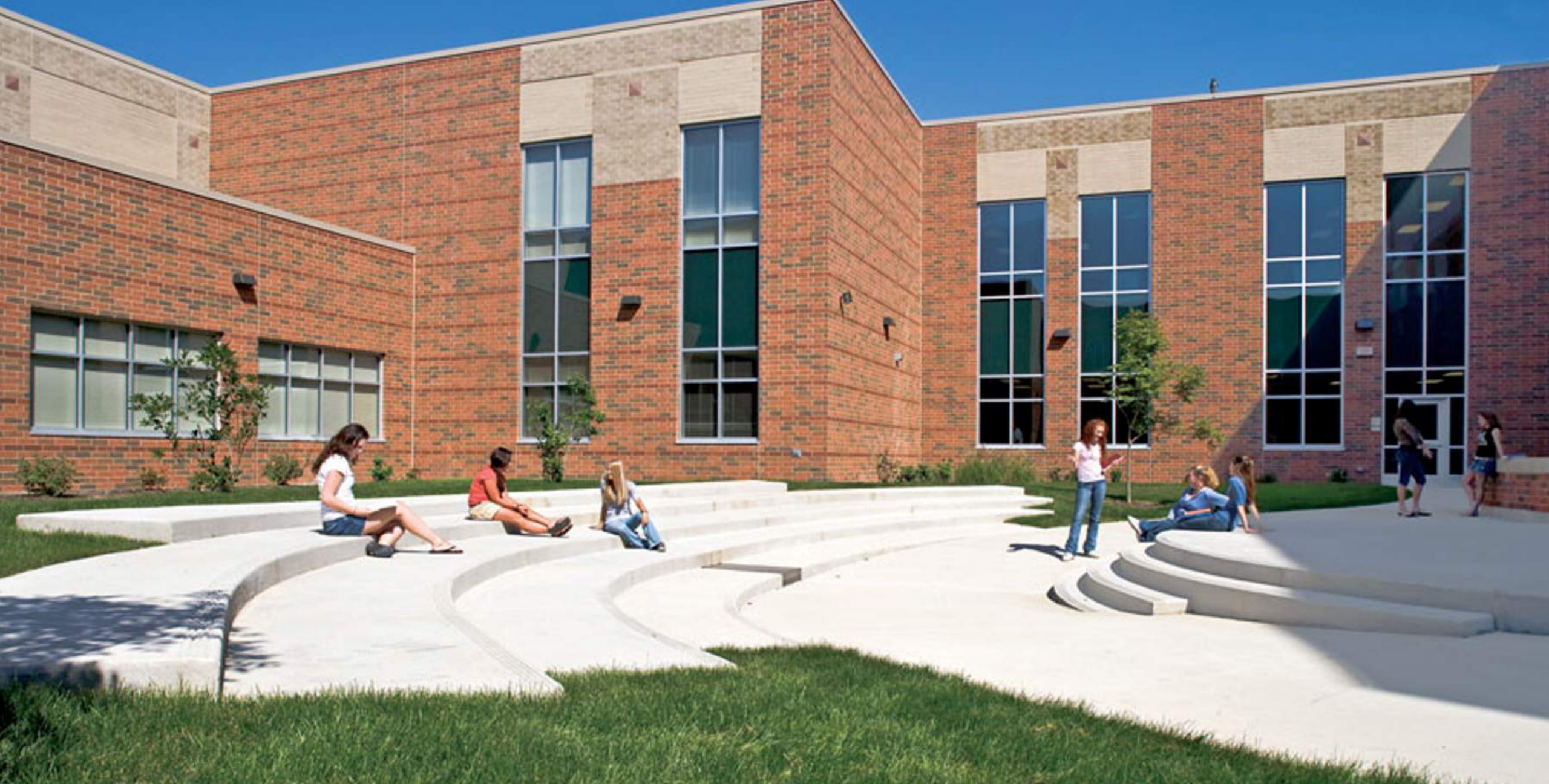
OUTDOOR LEARNING SPACE