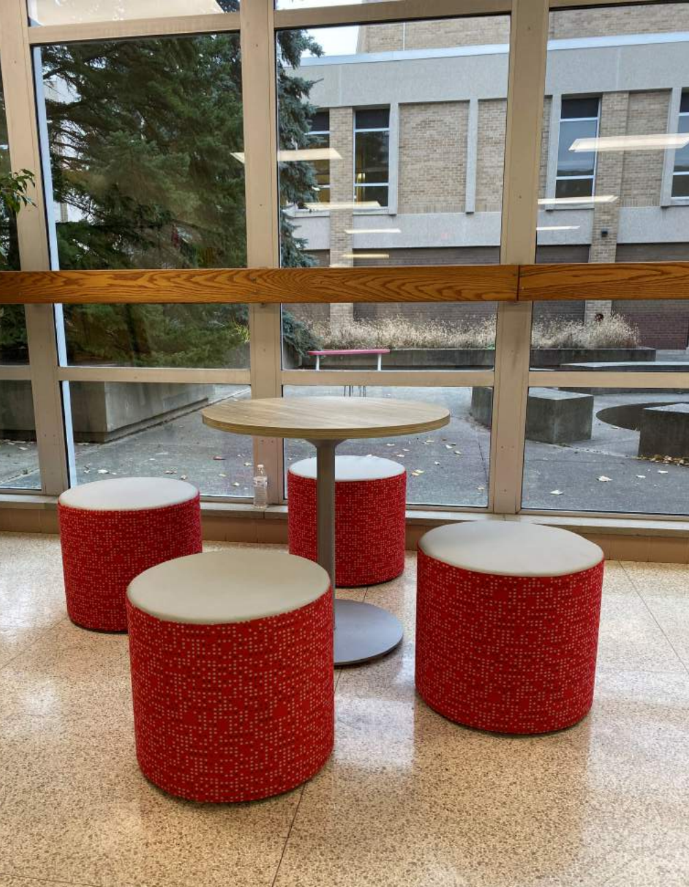
VARIETY OF FURNITURE