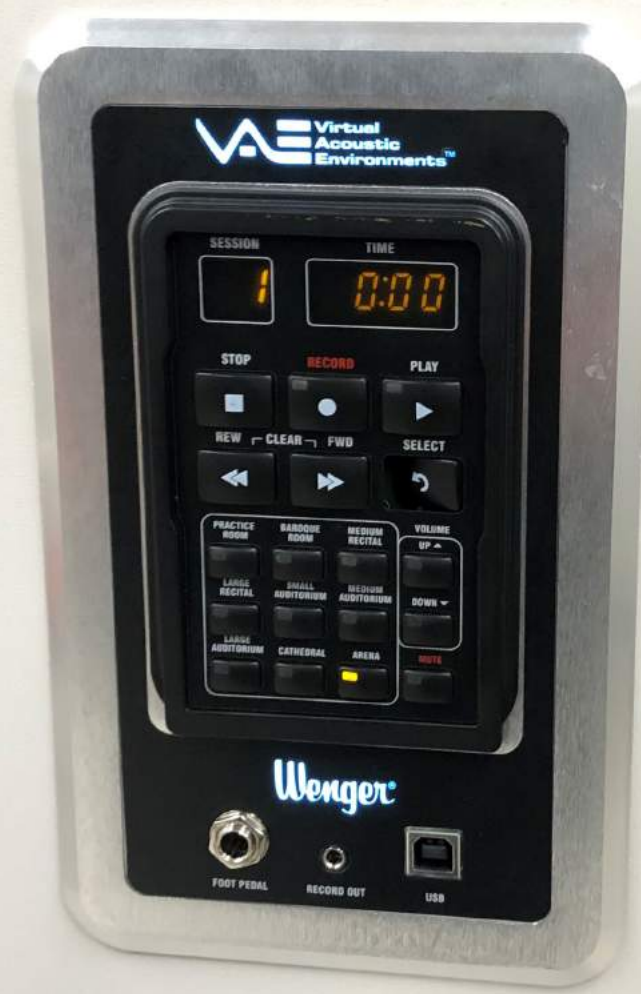
Washington Middle School – Music Room