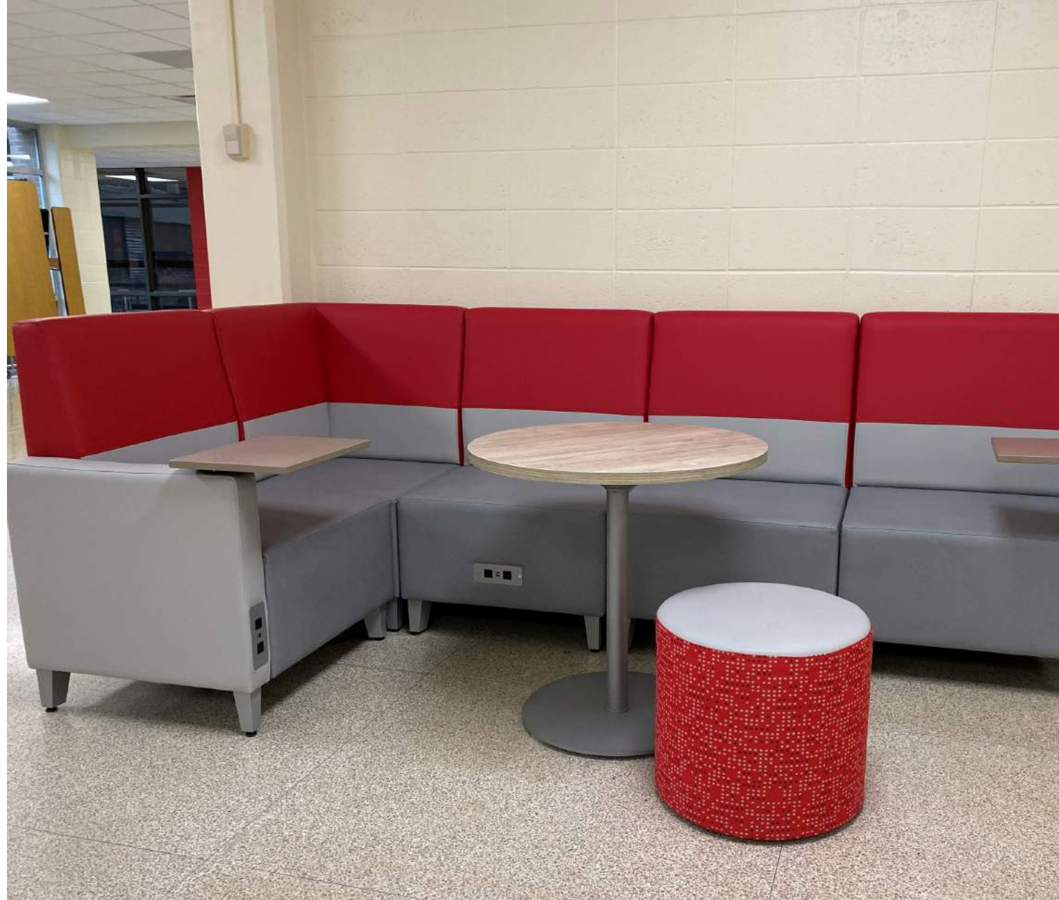
Edison Elementary School