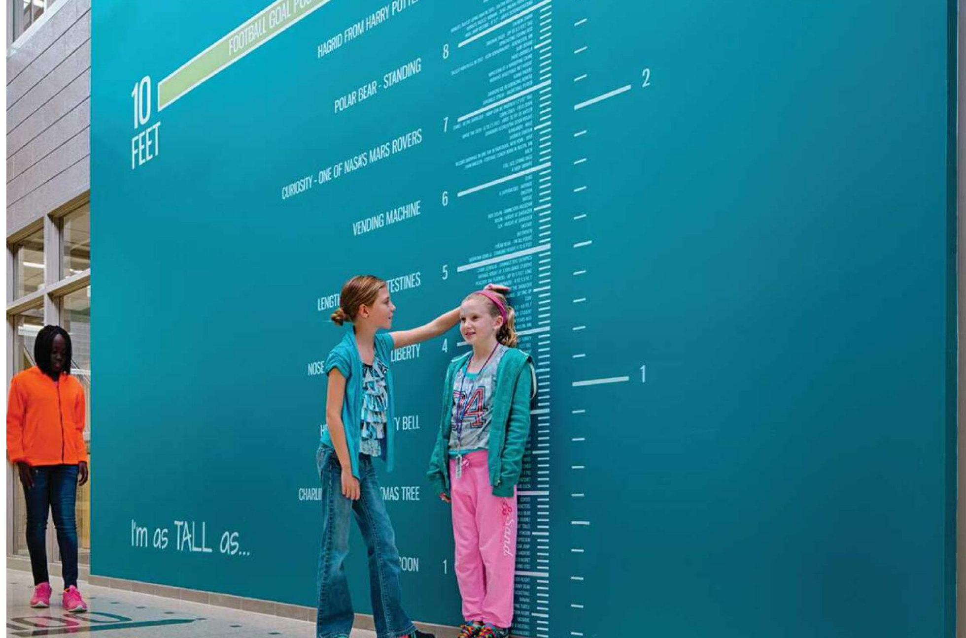
BUILDING AS A TEACHING TOOL